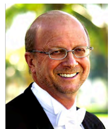
JO-MICHAEL SCHEIBE COLLEGE